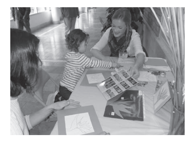
February Hawaiian Days at the Children's Garden www.legacyhealth.org/gardens

The Children's Garden at Emanuel & The Stenzel Garden at Good Samaritan Celebrating 20 years of healing, hope and health.